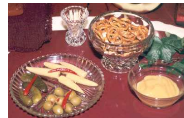
Pickled Jalapeno Products and Sweet Mustard Sauce